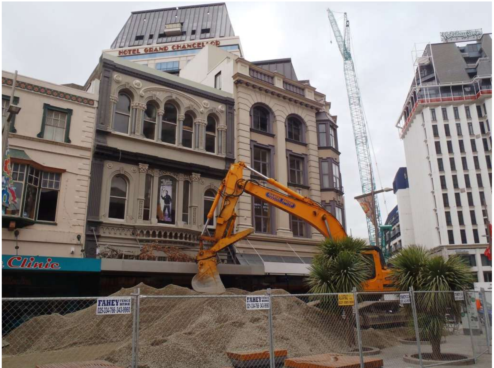
Cnr High & Cashel July 2011