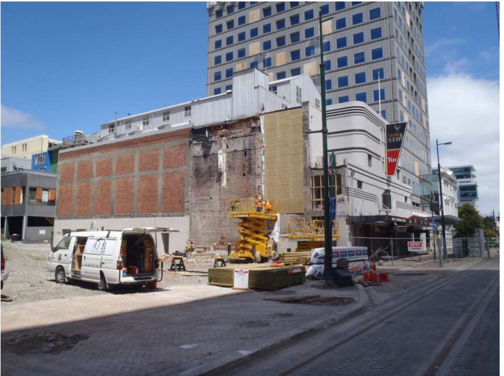
Site of Regent Theatre – March 2012