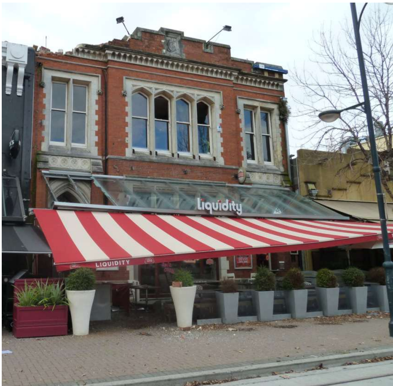
One of the bars on the Oxford Tce “Strip”