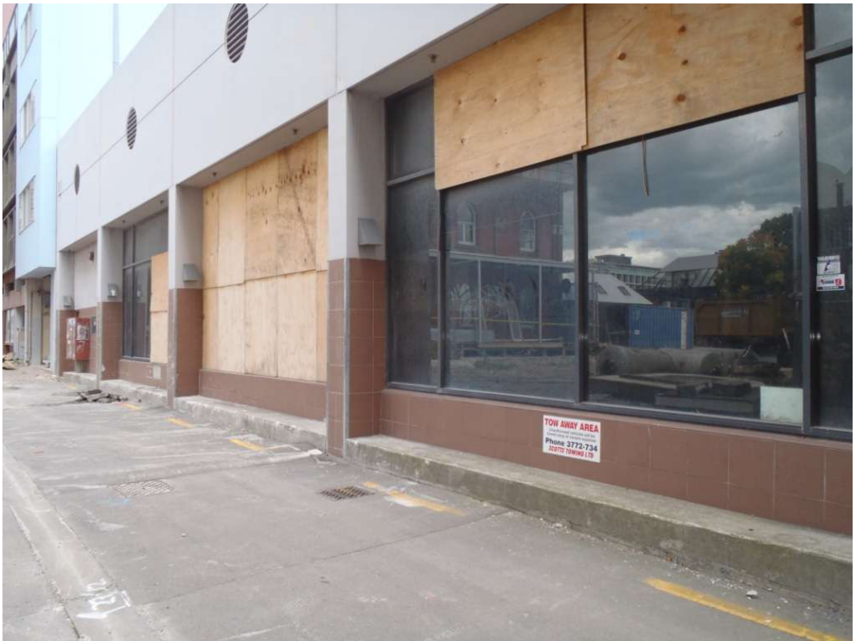
Tram shed, Tramway Lane - May 2012