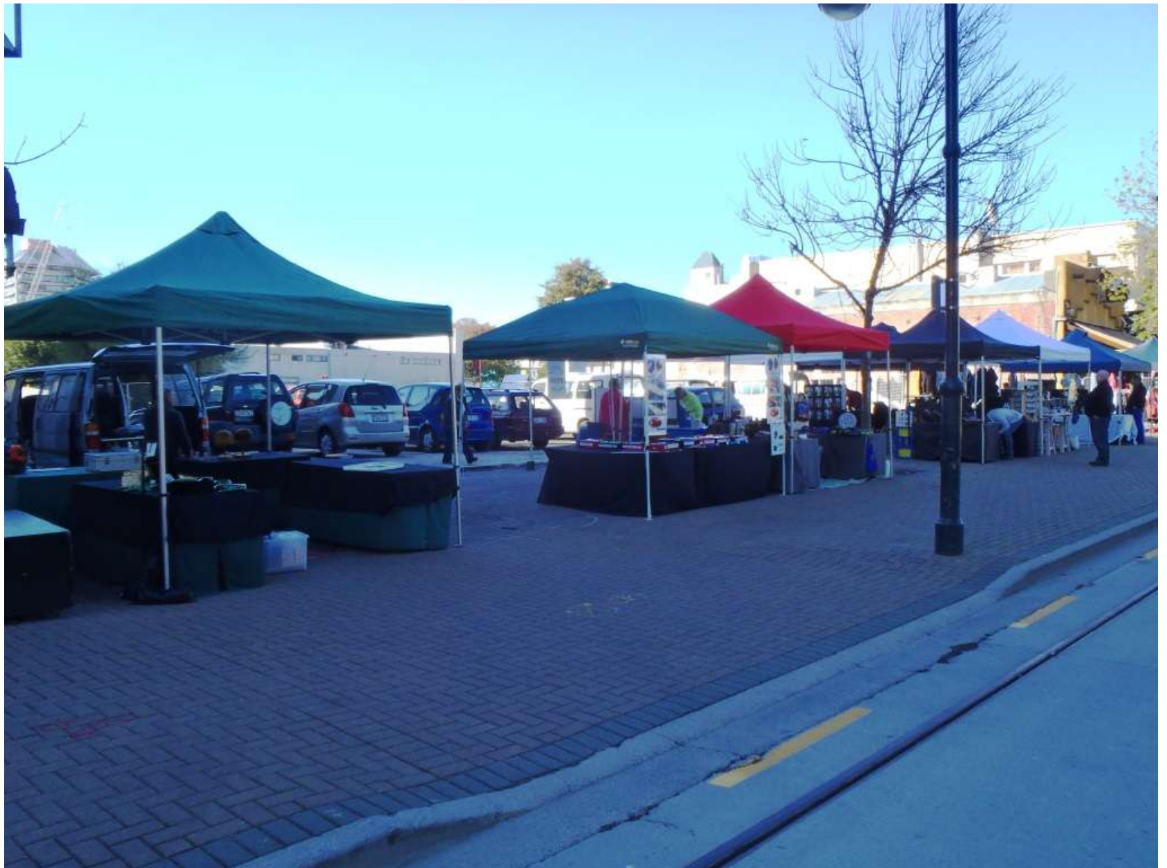
The Strip – most buildings gone, ex- Cathedral Square market Fri-Sun