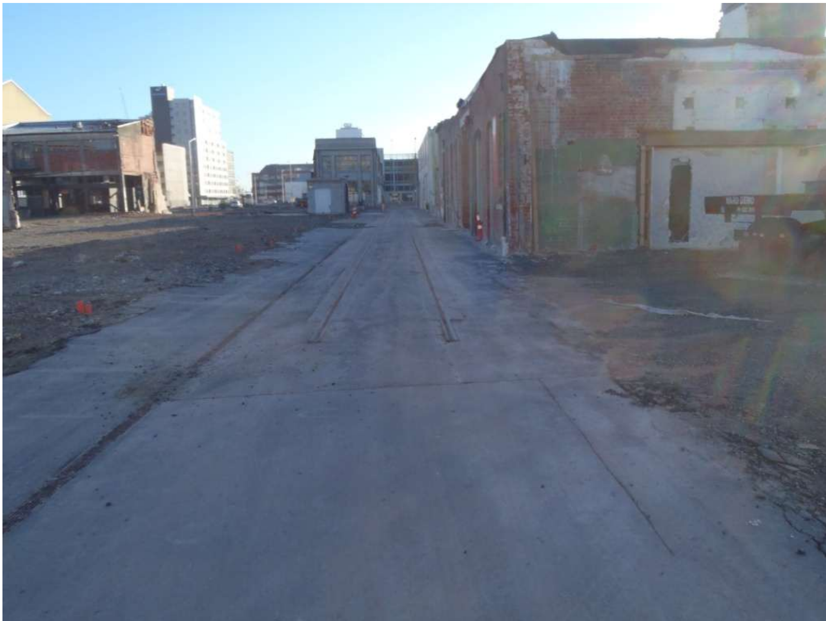
Poplar Lane 1 June 2012 – tram tracks still there!