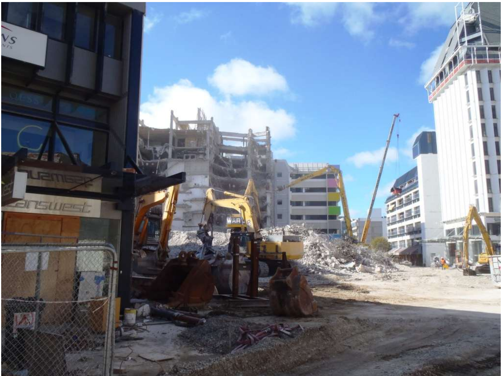
May 2012 - High-Cashel. Grand Chancellor Hotel almost down