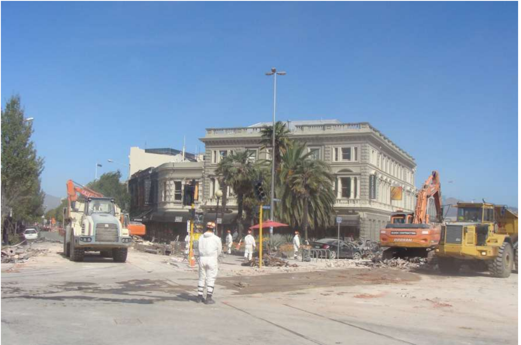
High Street , S.E. from Manchester - 3 March 2011