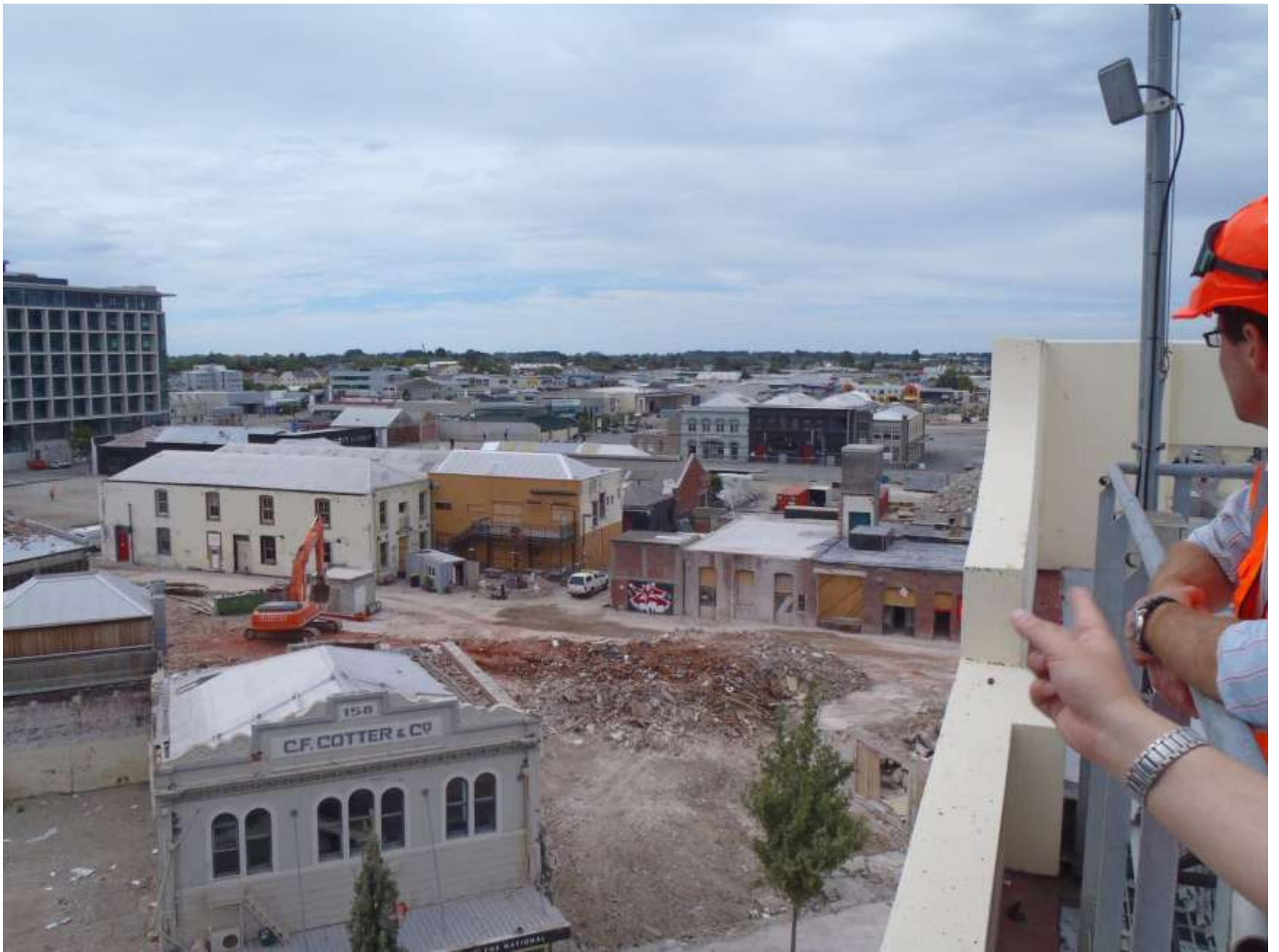
View from top of High St P.O. - remains of Poplar Lane