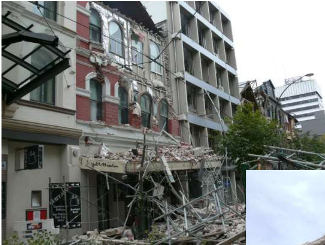
(was) Mayfair building Cathedral Junction