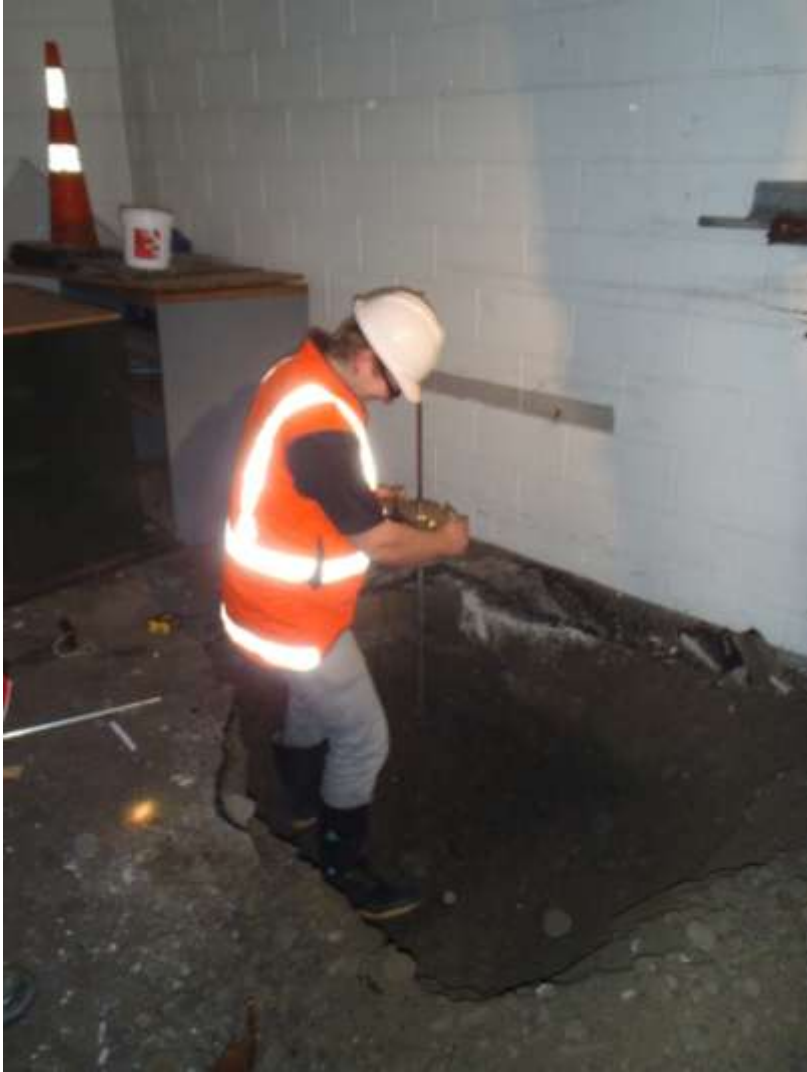
Tram shed wall damage - geotech testing