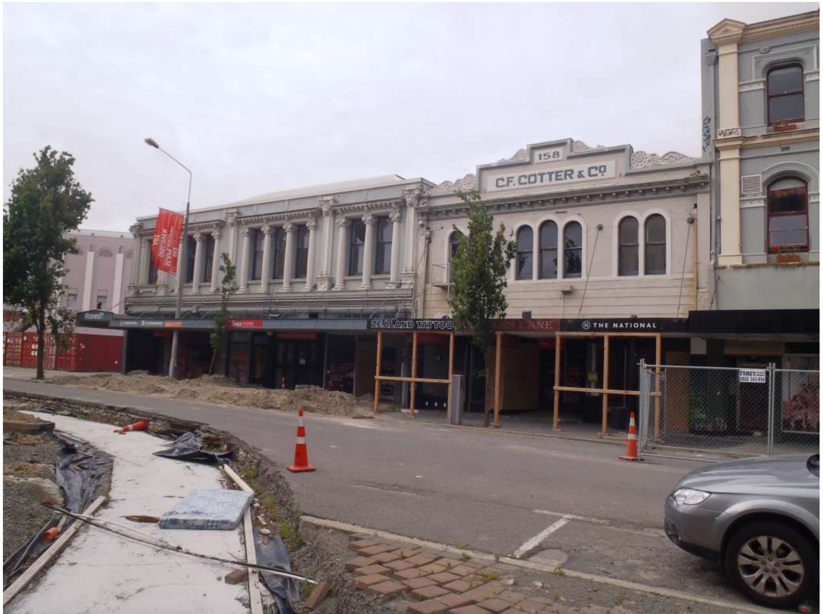
2011 – track formation in place, most buildings standing