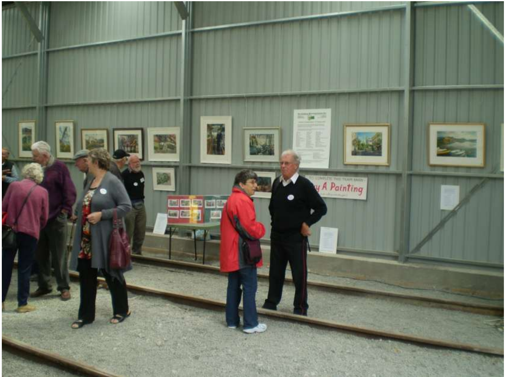
Don's paintings on display – 3 more sell on the day!