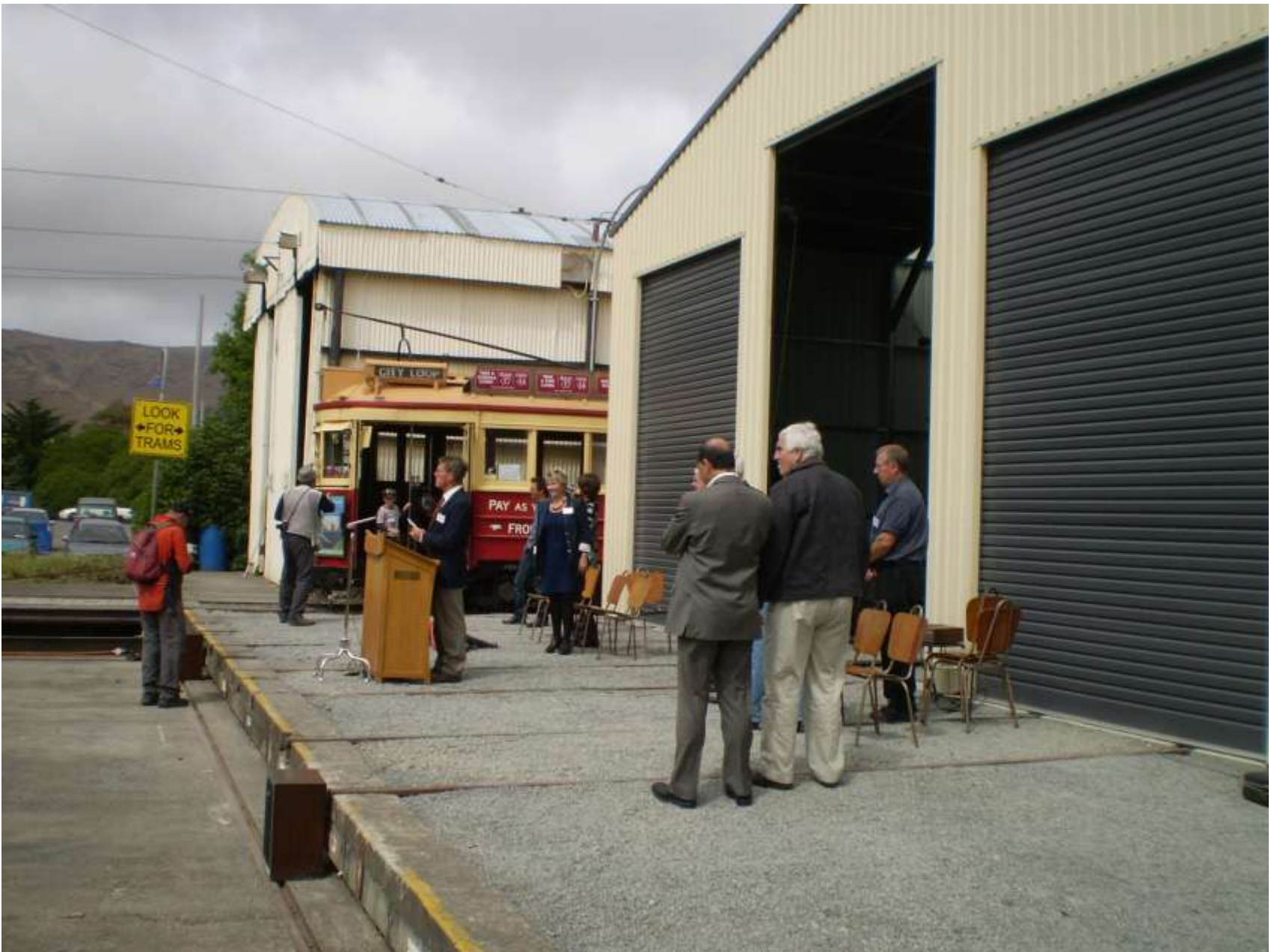
Door's open – time to go in for a look