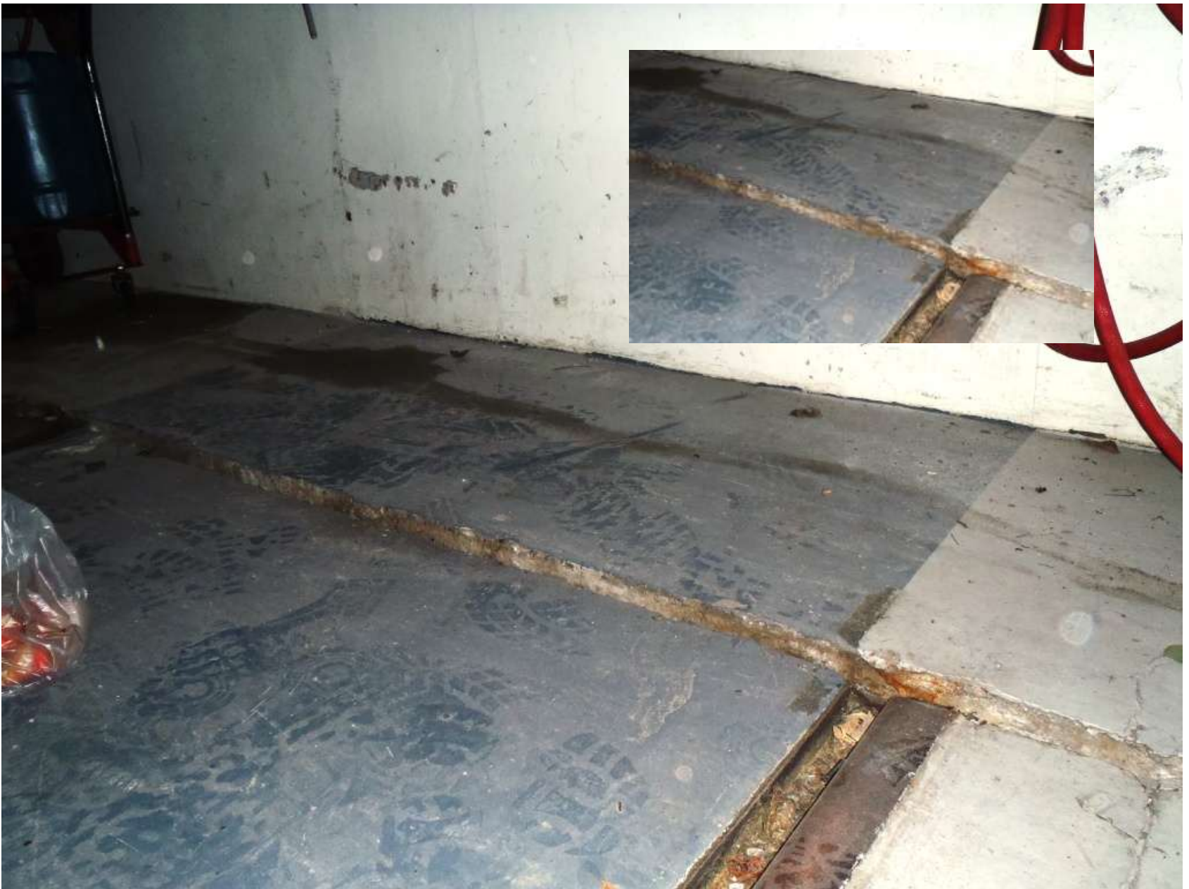
Damage to tram shed floor