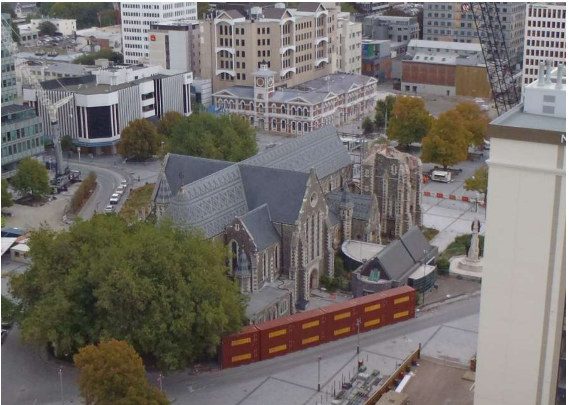
SW View from Pacific Tower 8 March 2012