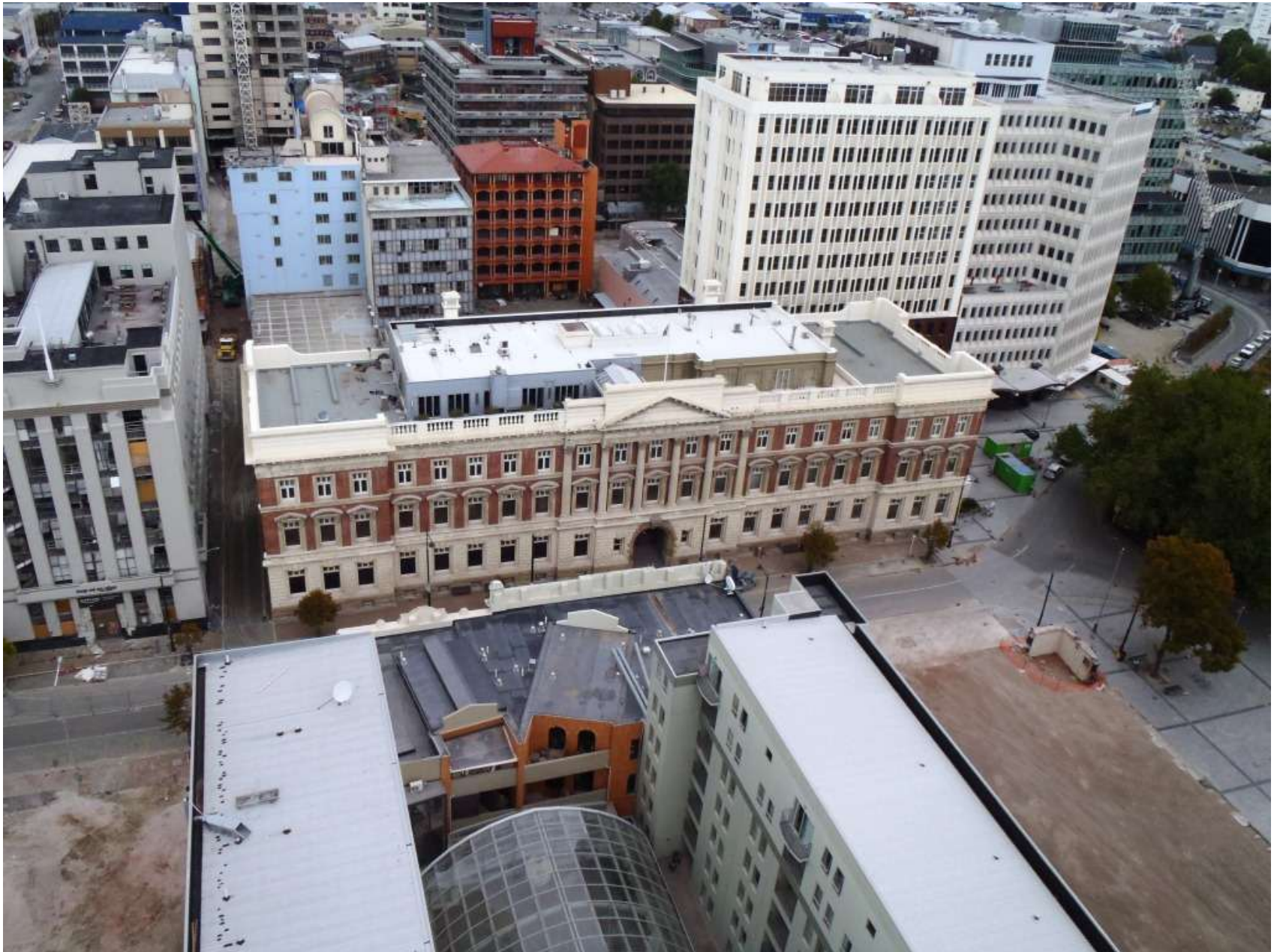
March 2012 - looking down on Cath. Jn. from Pacific Tower