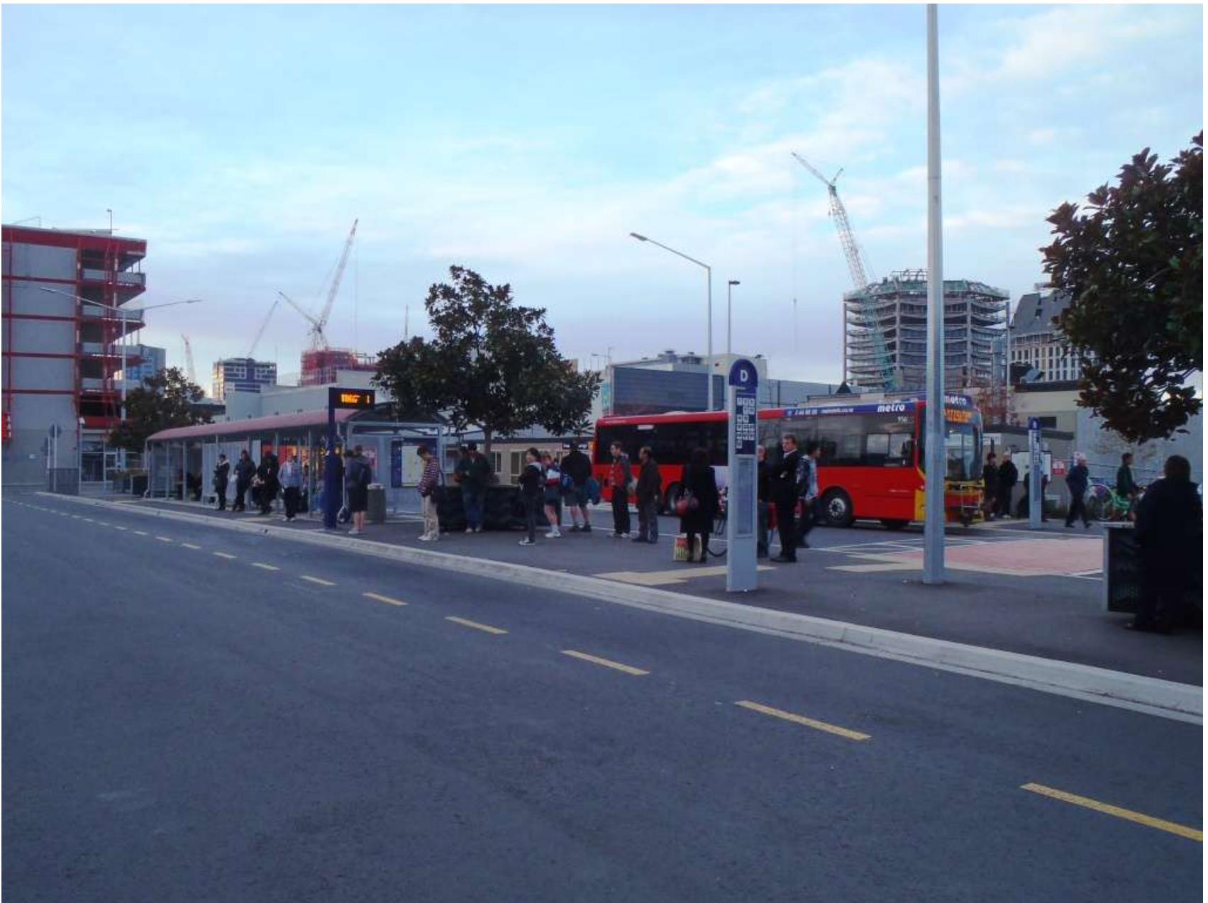
“Central Station” – temporary bus exchange