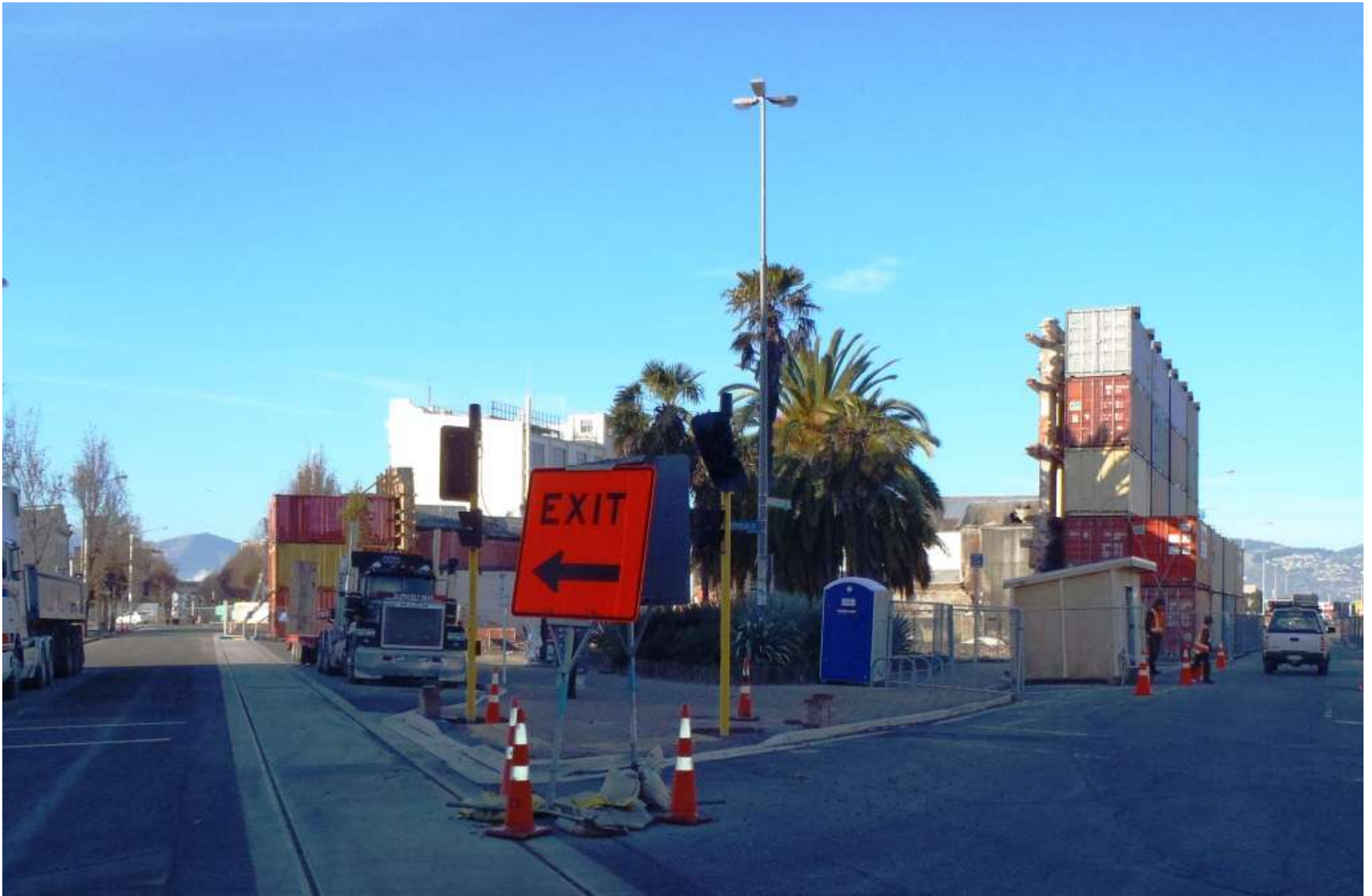
High Street , S.E. from Manchester - 1 June 2012