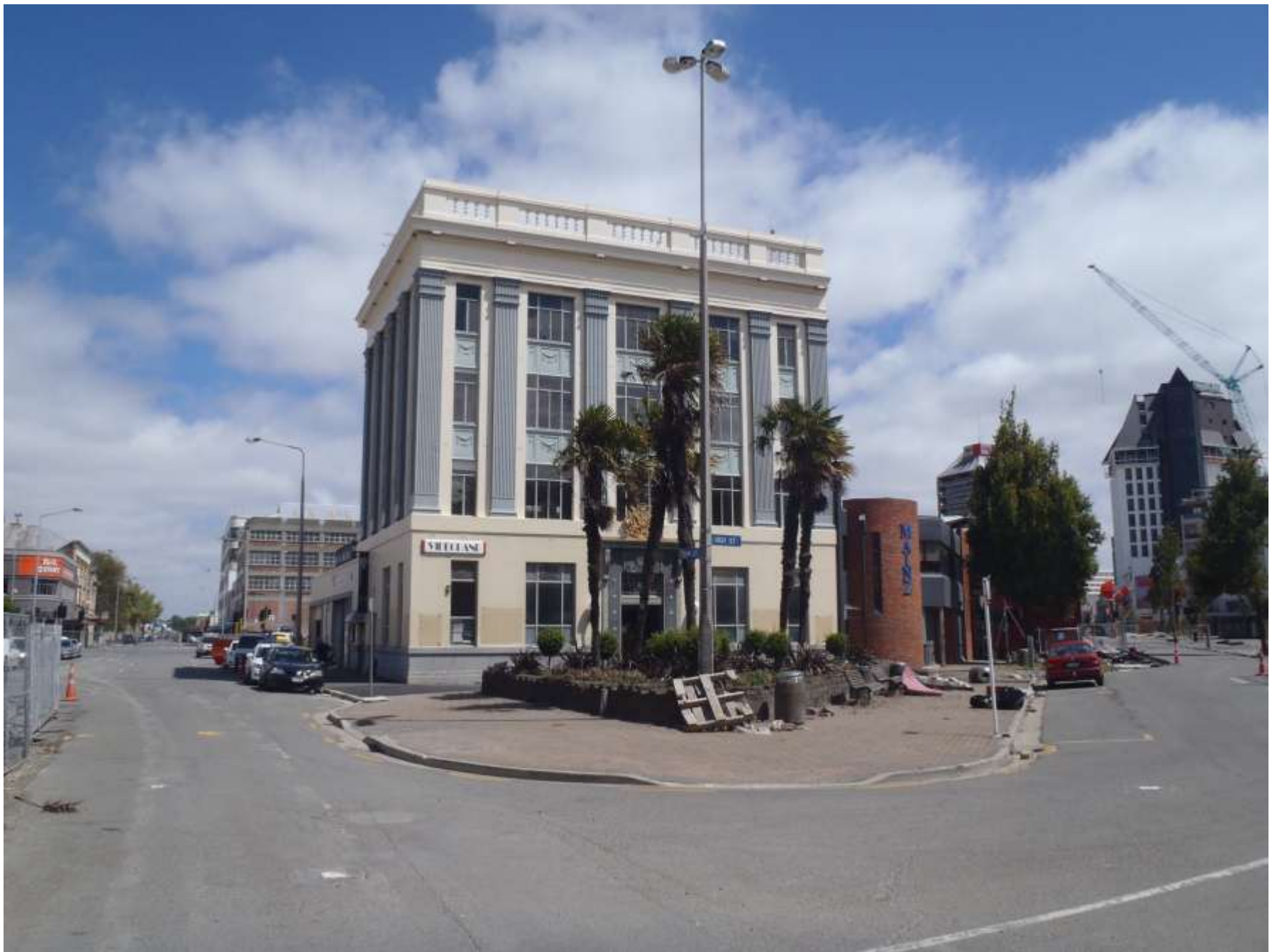
Alice's (former High St P.O.) - undamaged!