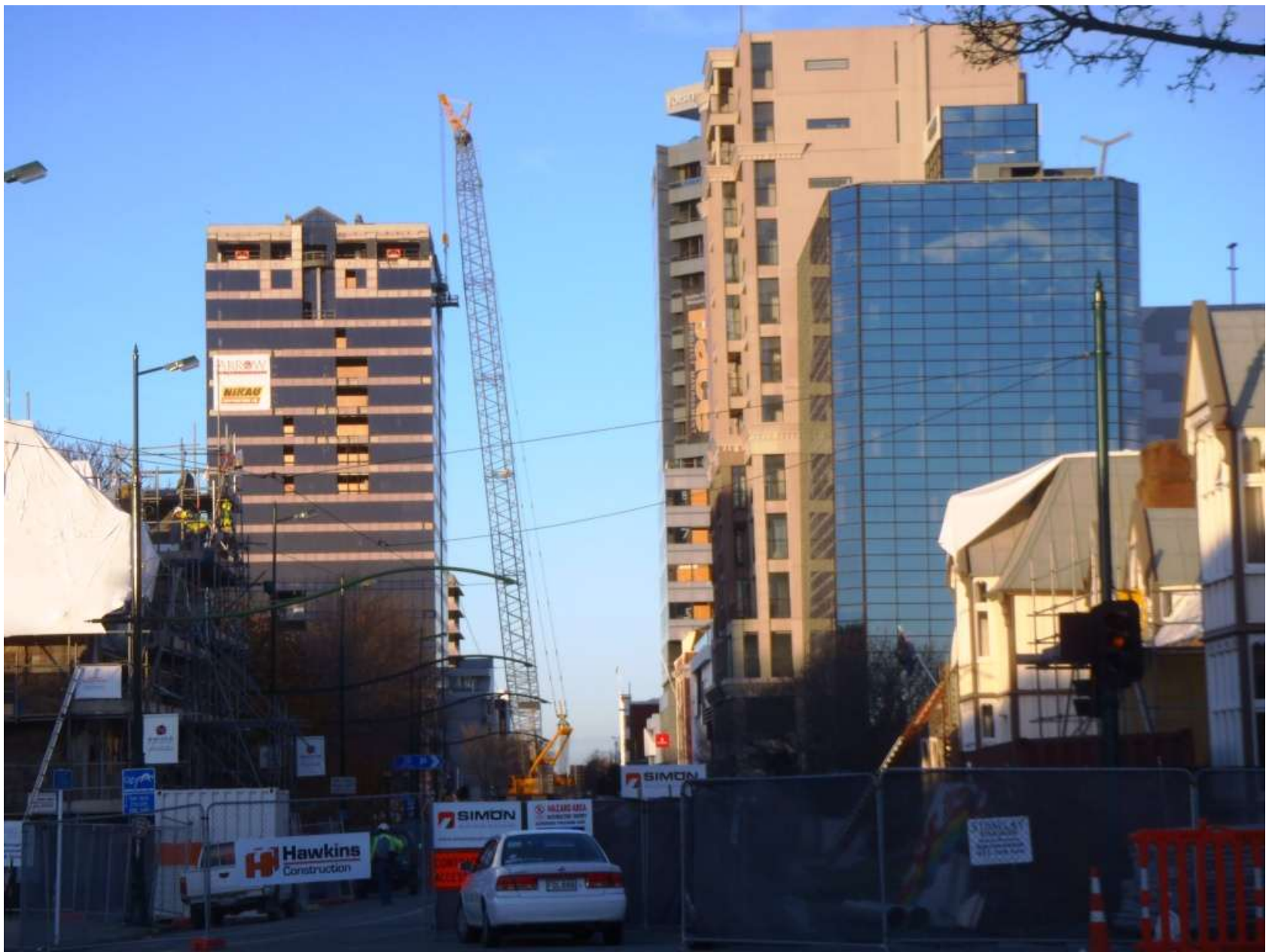
Most high-rises - going