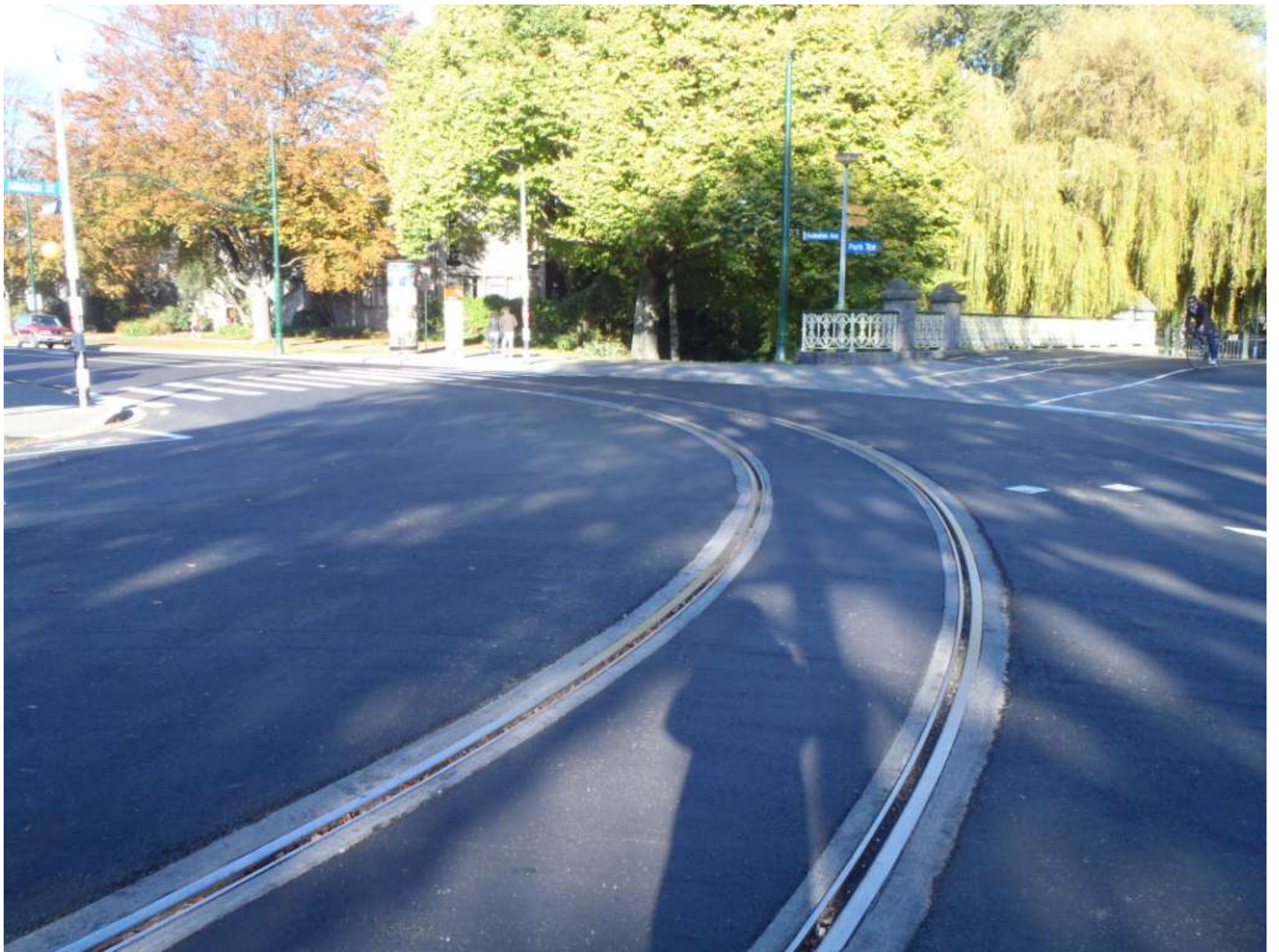
Same spot 31 May 2012