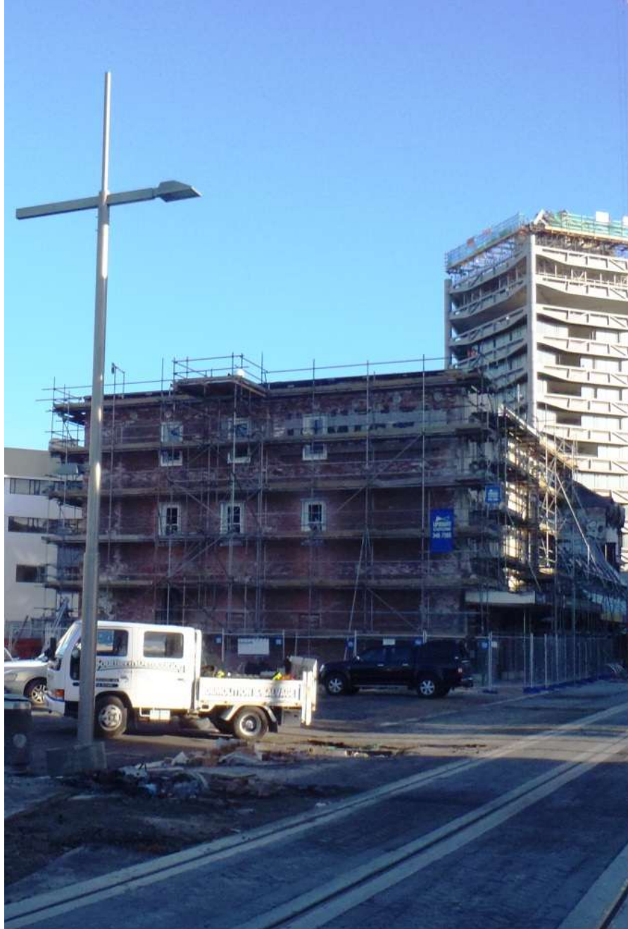
High Street , N.W. from Manchester - 1 June 2012