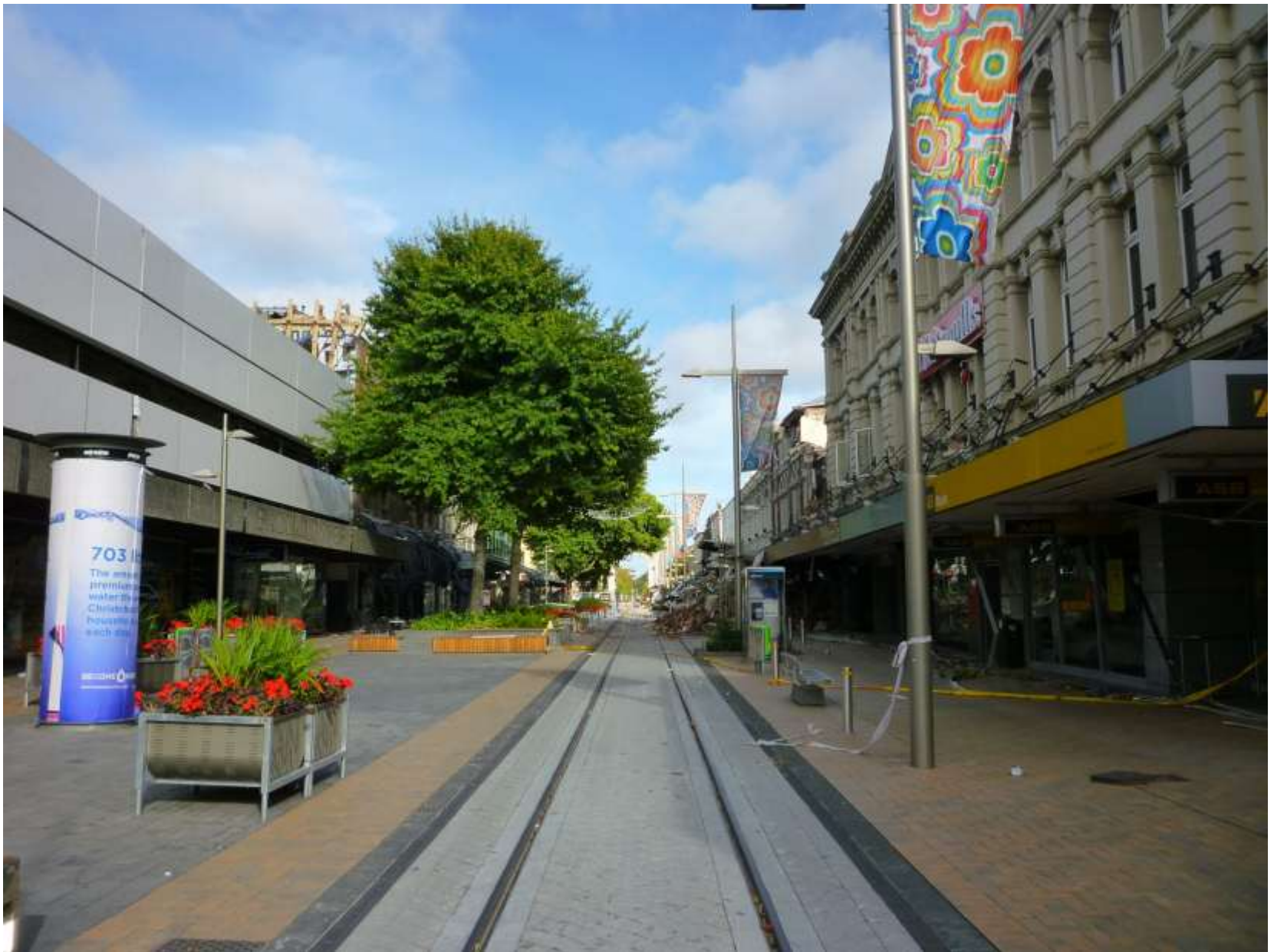
Cashel Mall - Feb 2011 quake