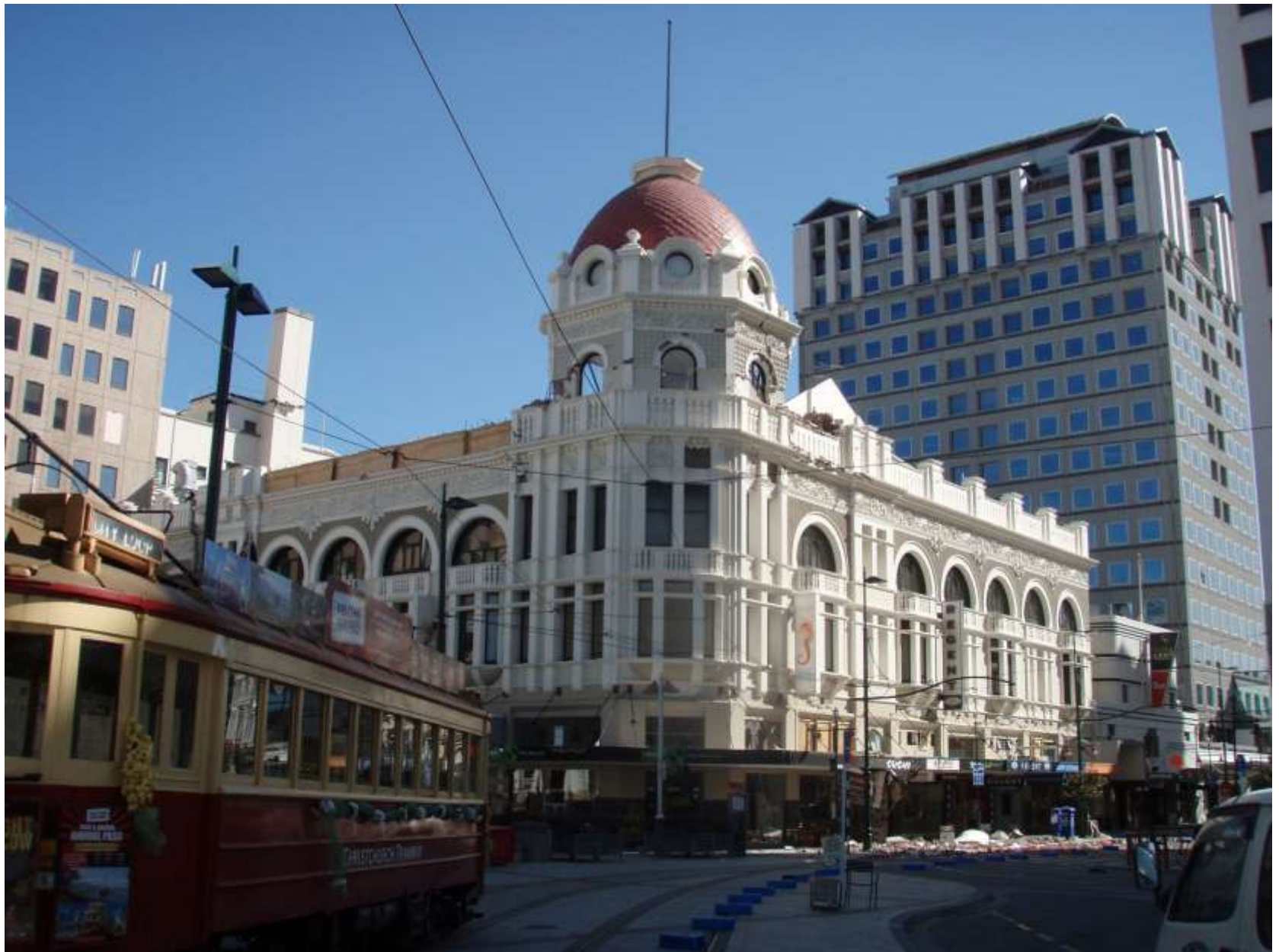
Regent Theatre Building – March 2011