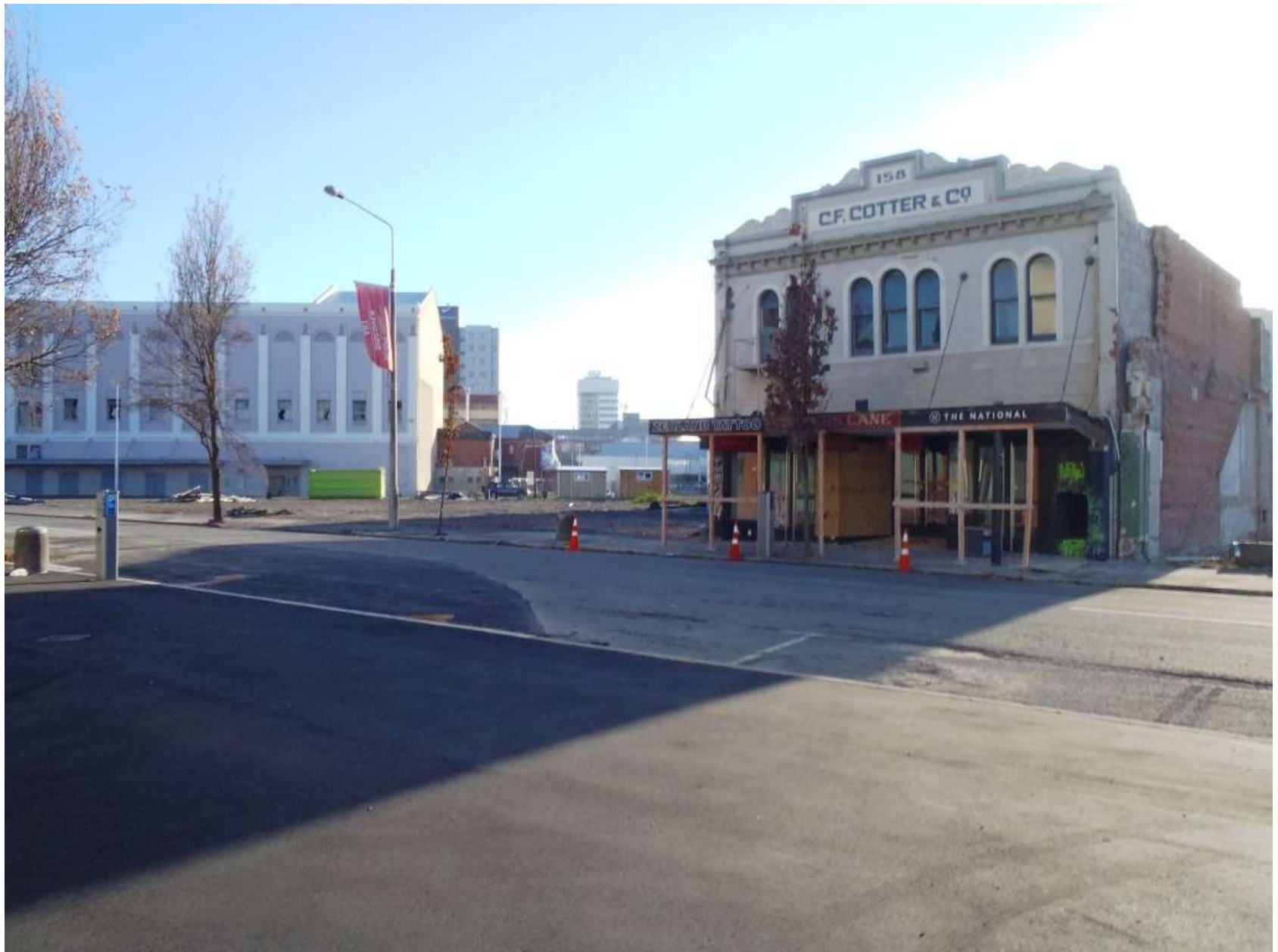
2012 – track formation covered, most buildings down!