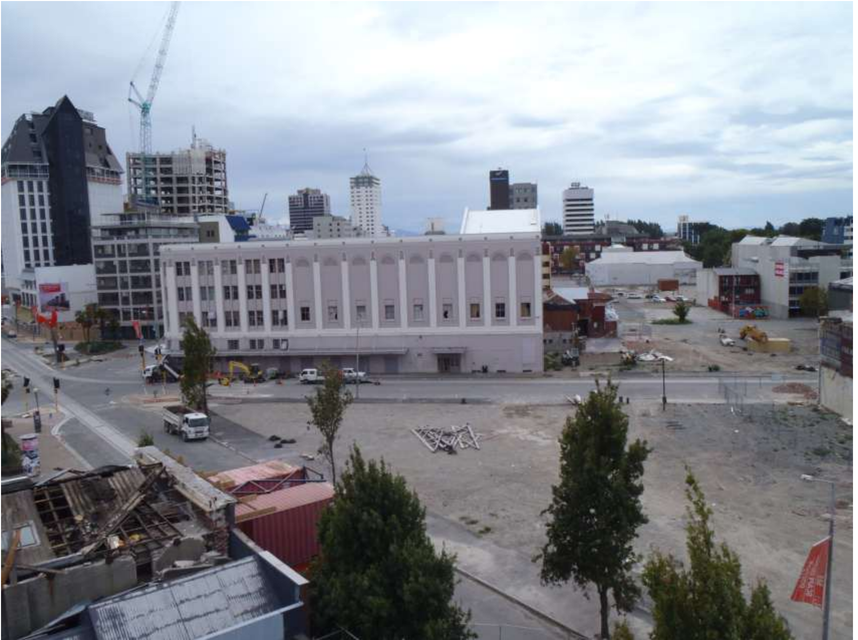
Looking E. - site of former ANZ building in foreground