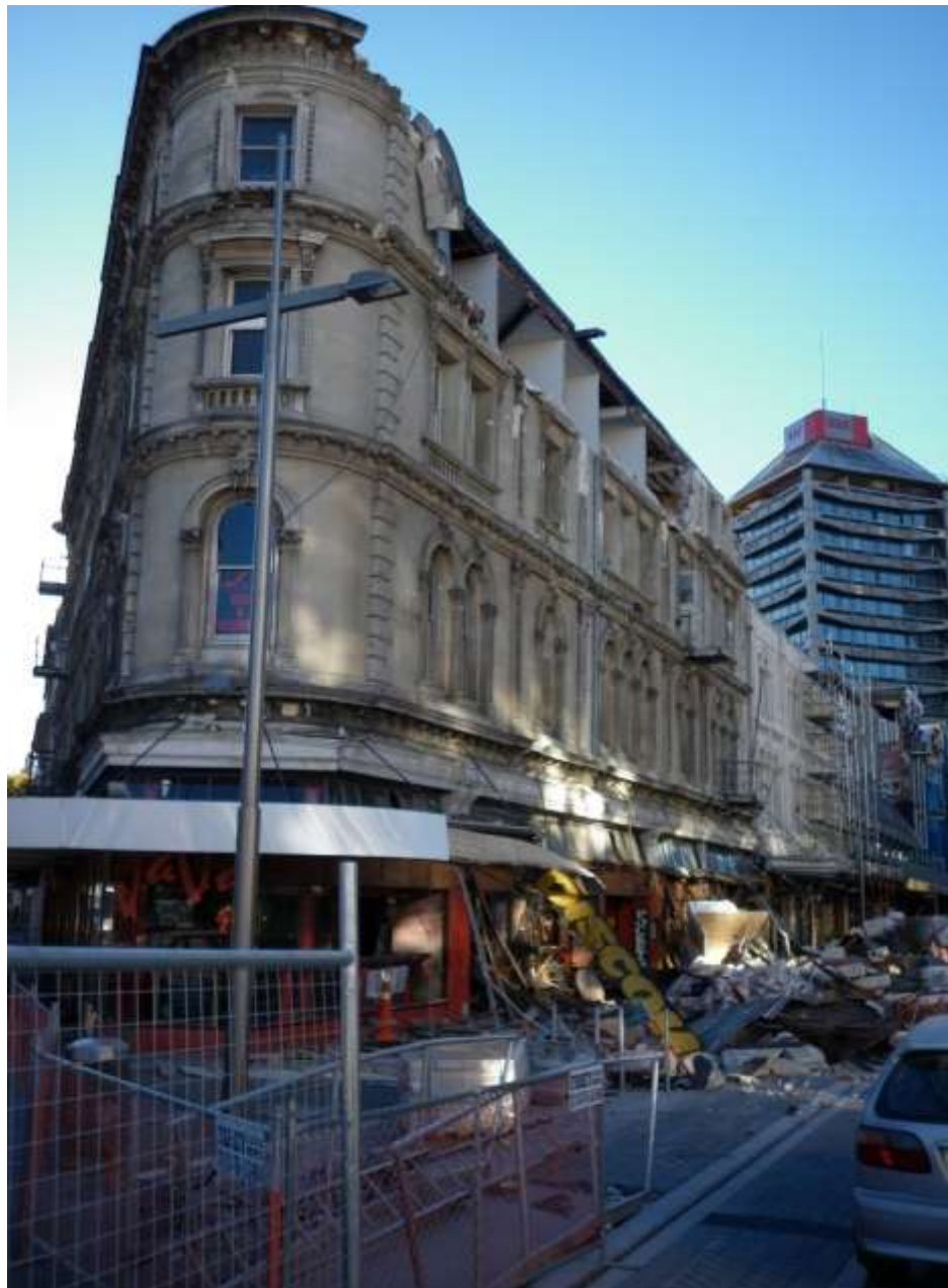
High Street , N.W. from Manchester - 2 March 2011