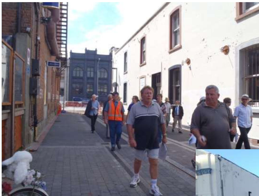
Poplar Lane 5 Feb 2011 and 1 June 2012