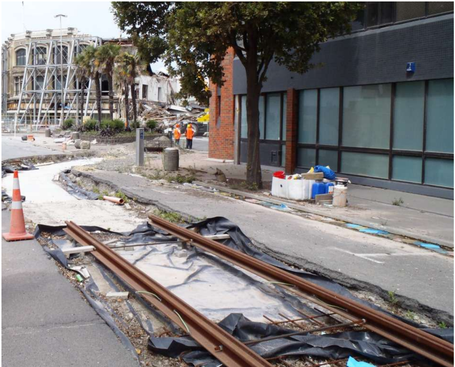
Trackwork halted by Feb quake – High Street