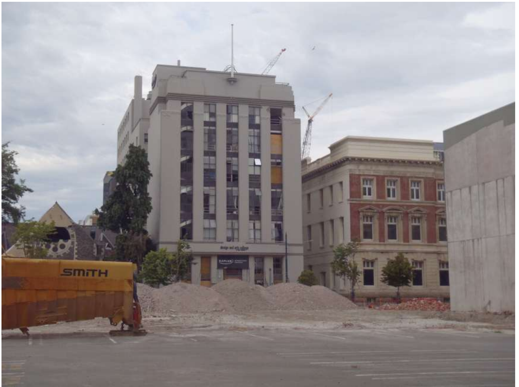
Former State Insurance Building – April 2012