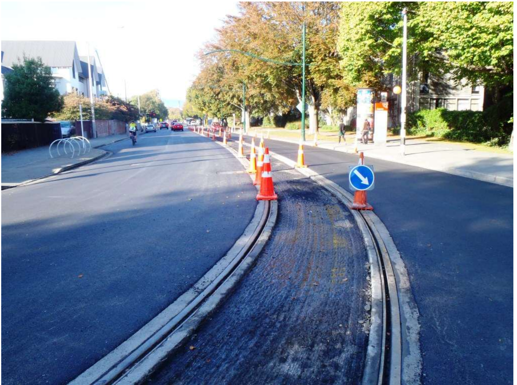
Resurfacing – Rolleston Avenue – April 2012