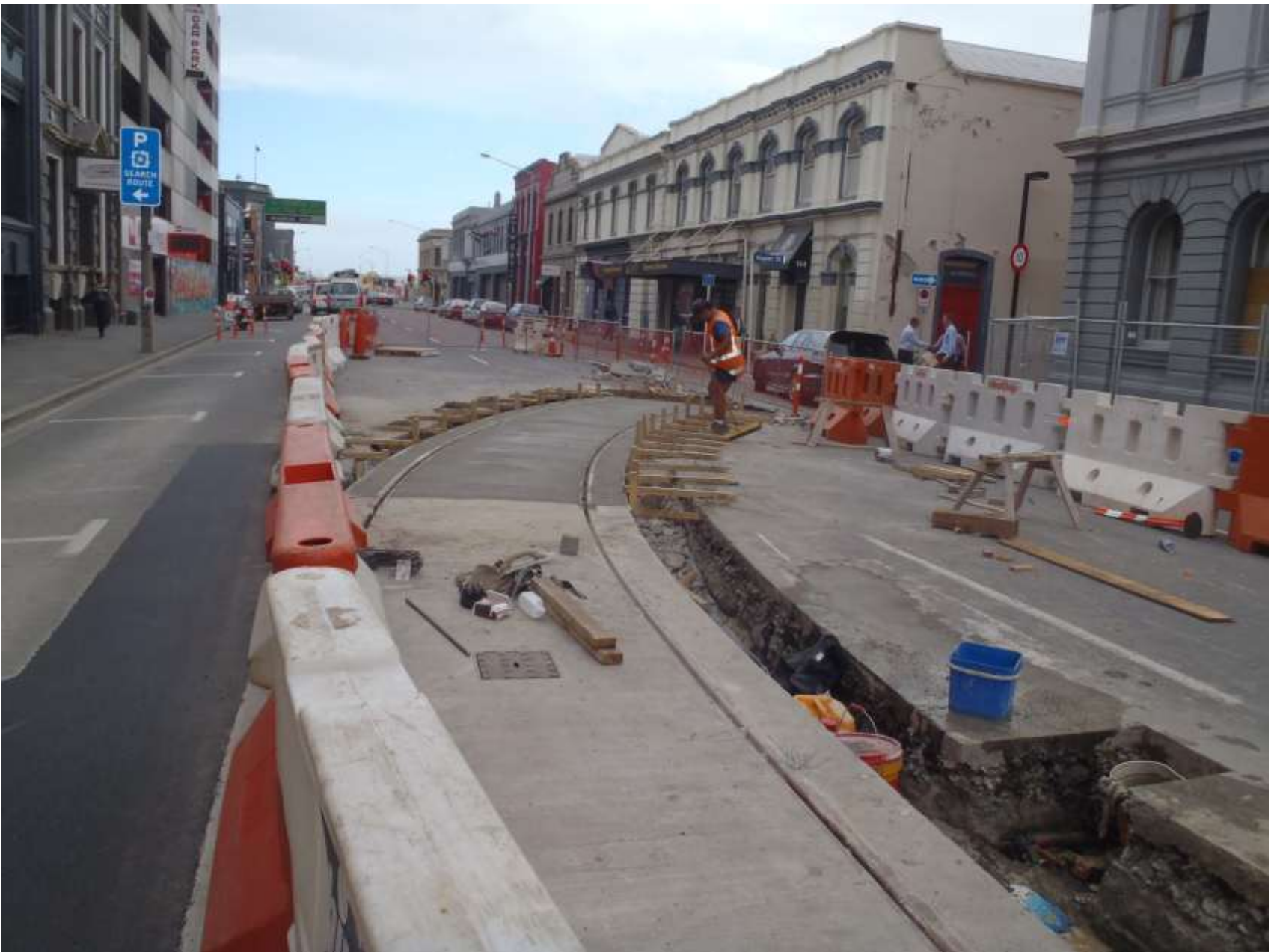
Lichfield into Poplar – last year