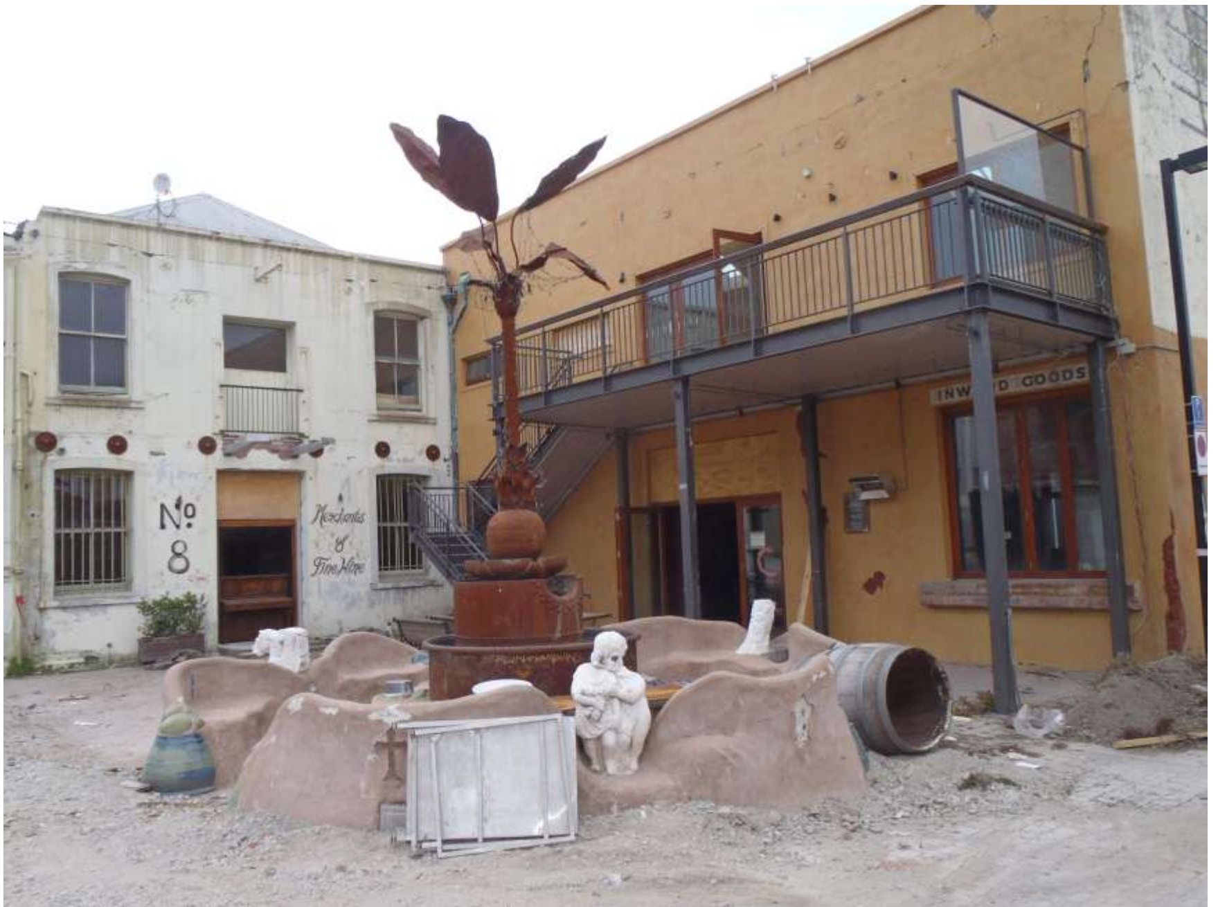
The Twisted Hop – still standing – just!