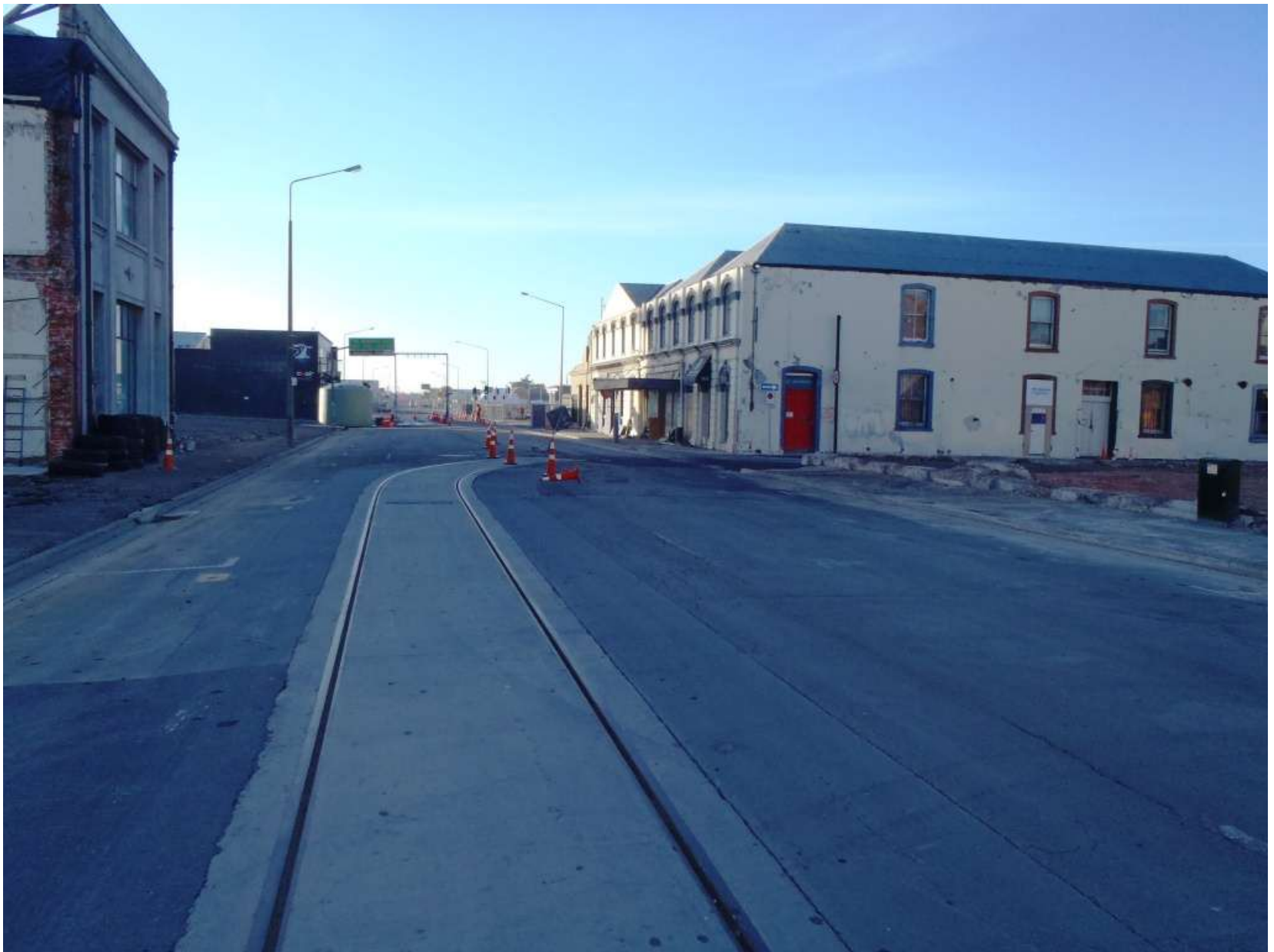
Lichfield into Poplar – 1 June 2012