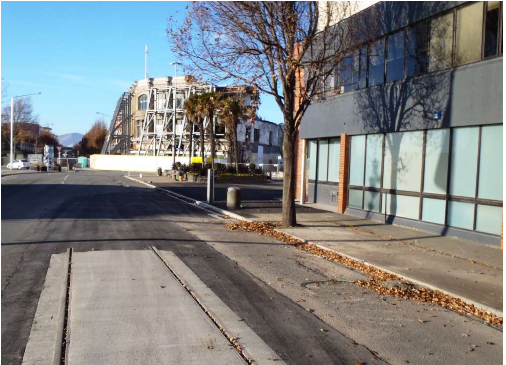
Trackwork tidied up, May 2012 – High Street