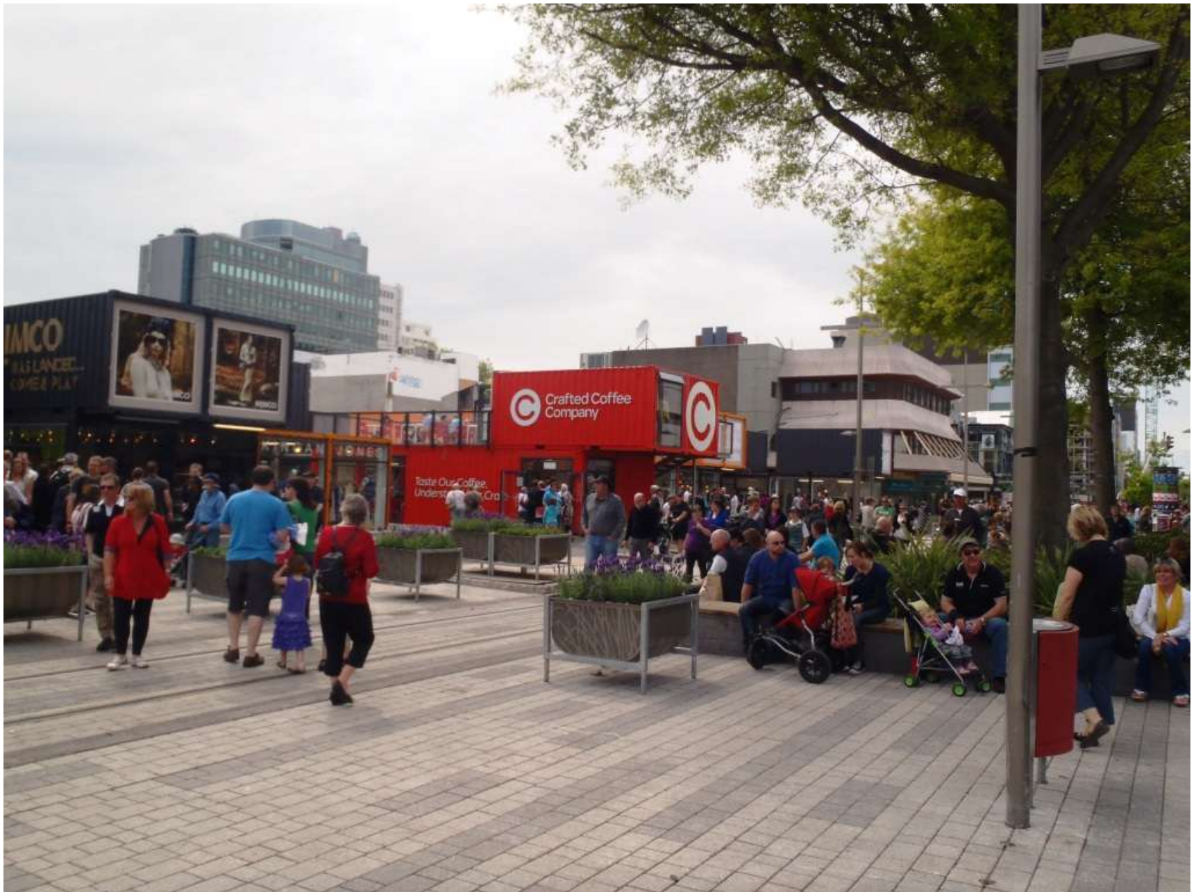
Cashel Mall – most buildings gone – Restart Nov. 2011