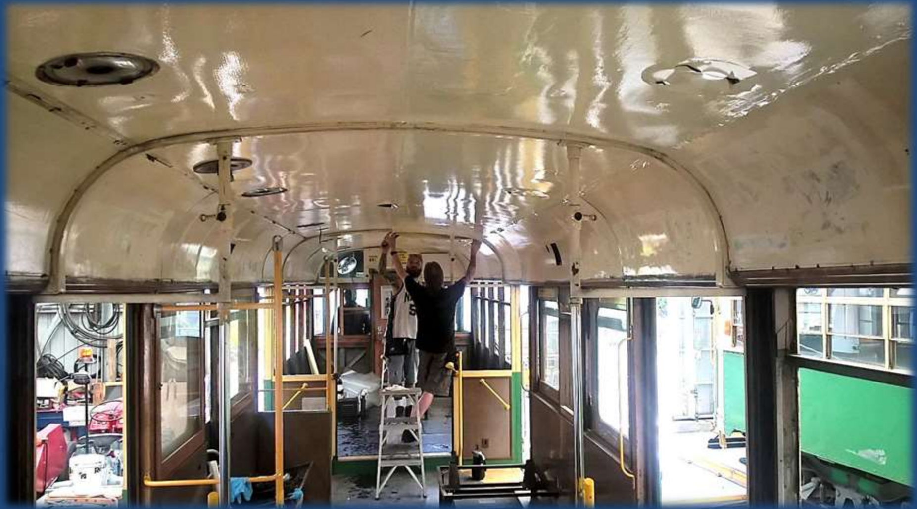
Vinyl adhesive sheets applied to battle-fatigued ceiling panels