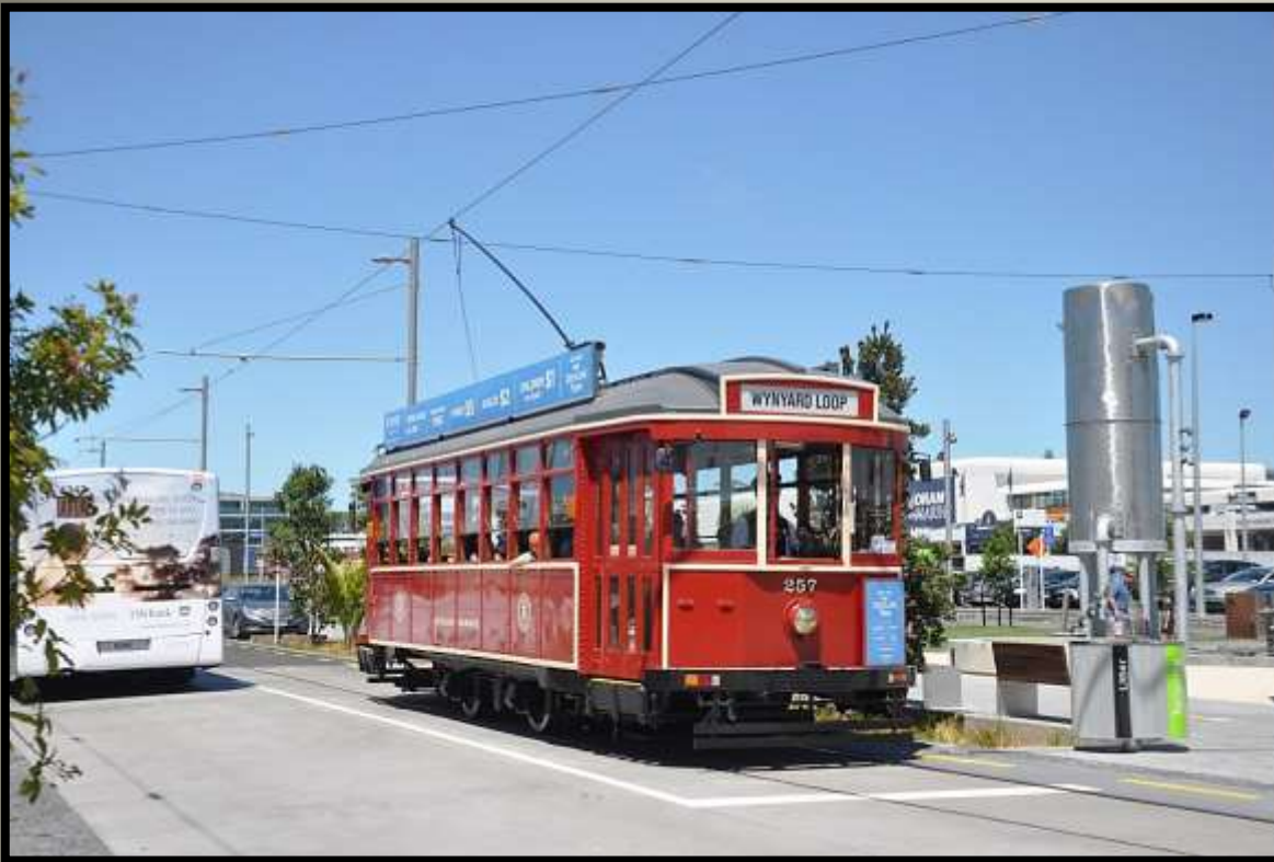
Jellicoe Street with the ASB Office building