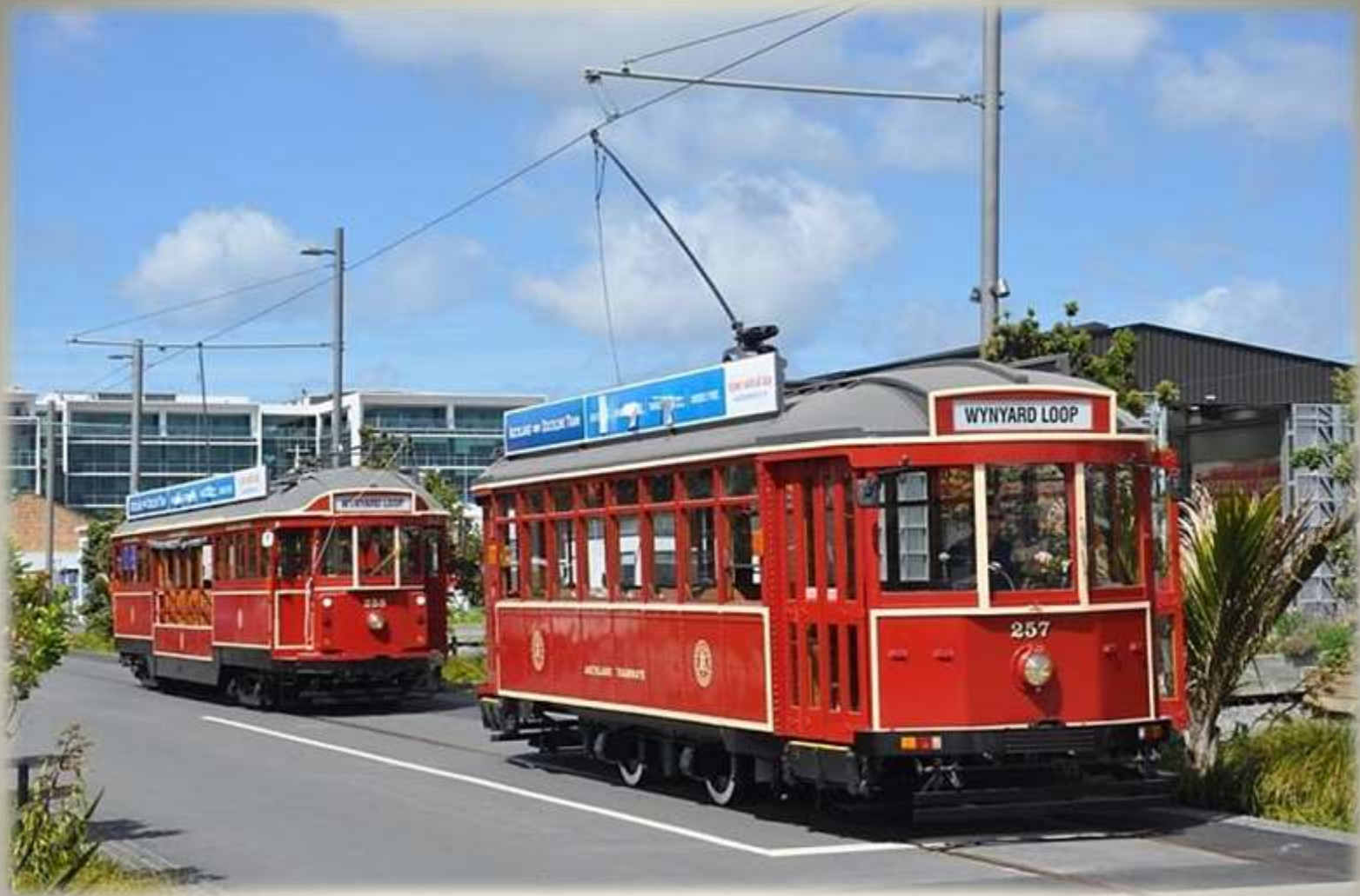
X1 No.257 (formerly M&MTB No.466) and W2 No.258 (formerly M&MTB No.421) undergo testing in the “new-look” Daldy Street, shortly before service reopened after an 18 month shutdown – November 2014